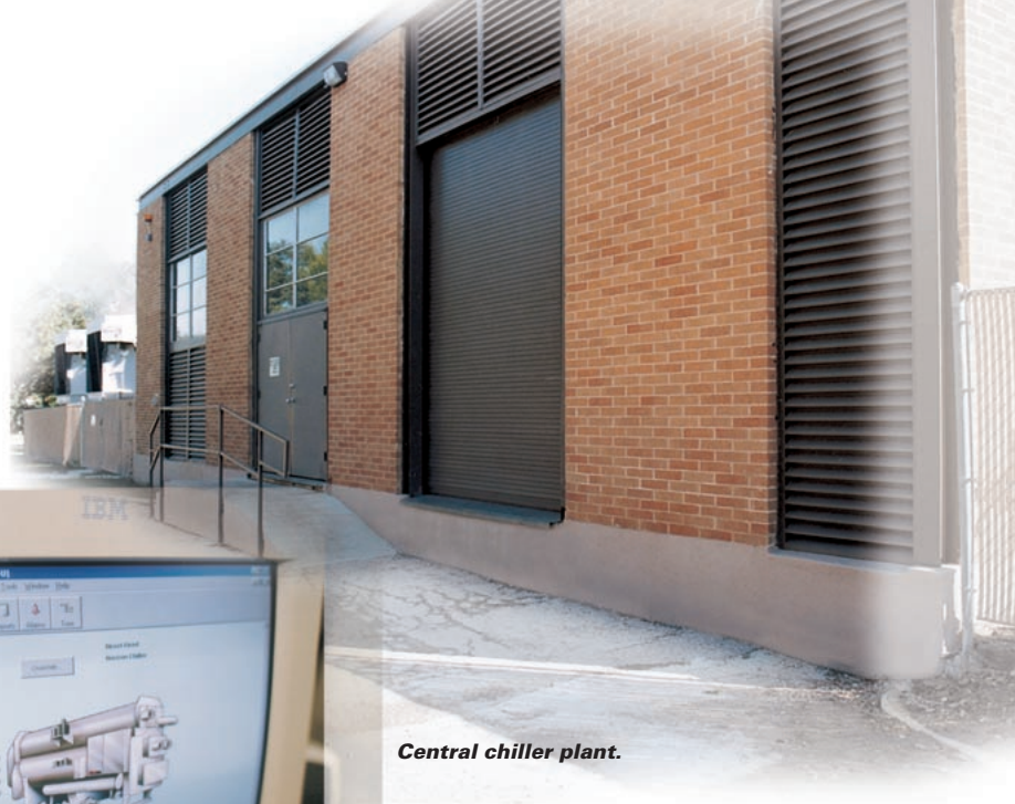
Central chiller plant.

“Both the control system and the equipment itself allows us to watch and maintain comfort levels very closely.”