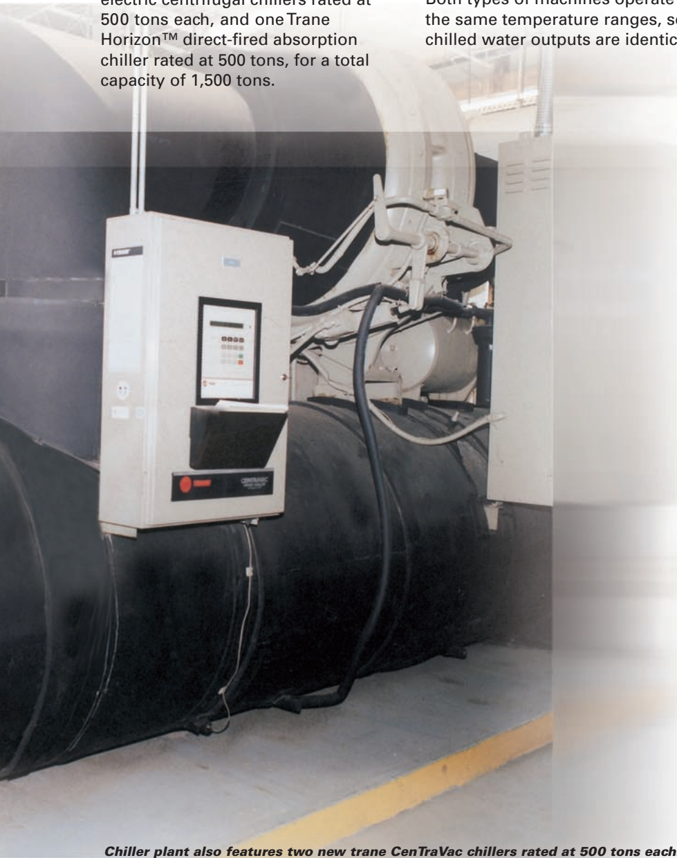
Chiller plant also features two new trane CenTraVac chillers rated at 500 tons each.

The central plant delivers chilled water to a mixture of constant-volume air handlers and Trane UniTrane™ horizontal concealed fan-coils that are installed in many campus buildings. Some of the newer campus buildings are equipped with Trane Modular Climate Changer™ central station air handlers and Trane