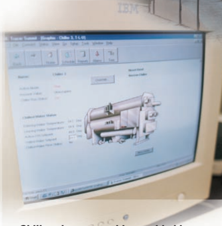
Chiller plant control is provided by a Tracer Summit system.