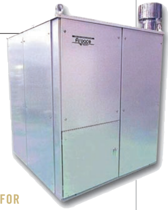
Yazaki gas-fired absorption unit

Hot water absorption chillers often use a heat byproduct from other industrial processes that might otherwise go unused. An example of this type application of hot-water absorption is the PSM Print Shop in Lake Forest, California, where a 40-ton absorption chiller is used to cool printing press components.