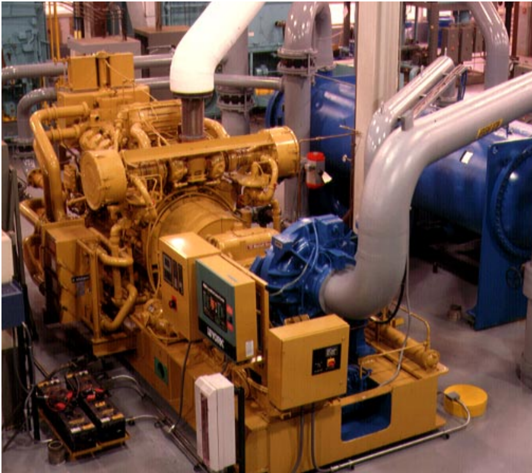
The hospital recently overhauled its central chilled water plant, which involved replacing two 750-ton centrifugal chillers with the 1,350-ton YORK Millennium GED unit.

CFC-12 refrigerant, which is no longer being produced.