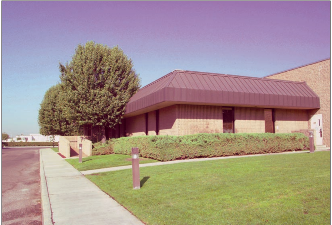
Officials at the Aquamar Inc., seafood processing facility in Rancho Cucamonga, CA, recognized the benefits of adding a natural gas-powered refrigeration system with heat recovery.