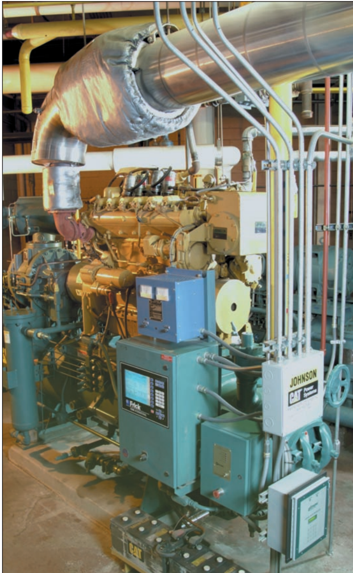
The Caterpillar gas engine compressor's recovered heat is used to preheat boiler feed water.

CHP systems such as the one being purchased by Aquamar have the potential to eliminate costly electric transmission and distribution bottlenecks, reduce peak demand, and improve power reliability and quality.