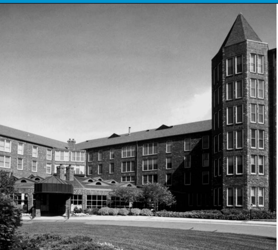
Natural gas central humidifier, 300,000 BTU with four burners; 120-unit wing of Becketwood high-rise in Minneapolis.

Residents of the east wing of Becketwood high-rise in Minneapolis were among the first to sing the praises of a natural gas-fired humidification system installed in their building in January 1996. DRISTEEM Humidifier of Eden Prairie developed and provided the unit and CenterPoint Energy Minnegasco covered costs to install it.