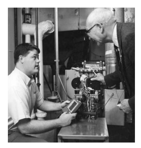
The DRISTEEM humidifiers range in size from 75,000 to 400,000 BTU, and from 56 to 300 lbs/hr output.

For more information, call DRISTEEM at 952-949-2415 or 1-800-328-4447.