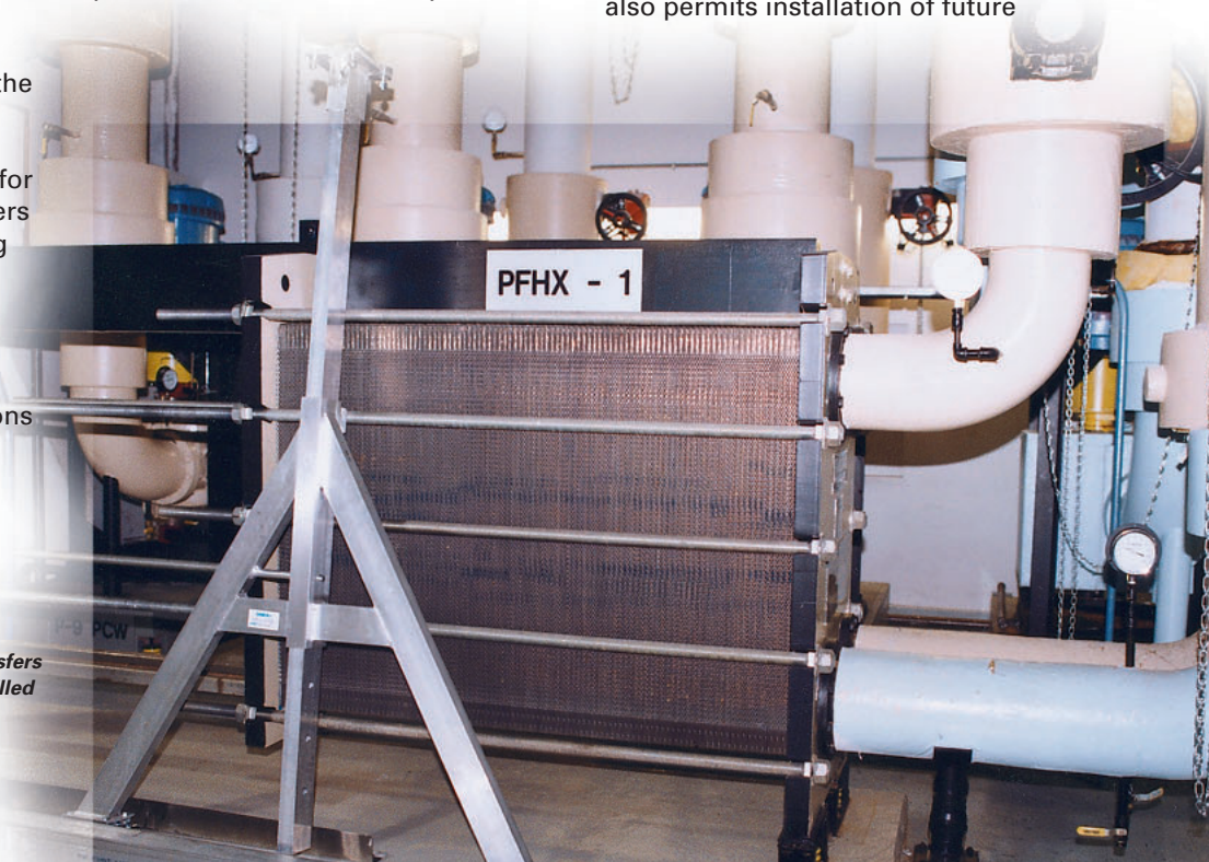
Large plate and frame heat exchanger transfers heat from the secondary to the primary chilled water loop.

The mechanical room that houses the chillers and much of the pumping equipment is exceptionally spacious, particularly for a Manhattan location. This simplifies service on the chillers and other mechanical equipment, and also permits installation of future