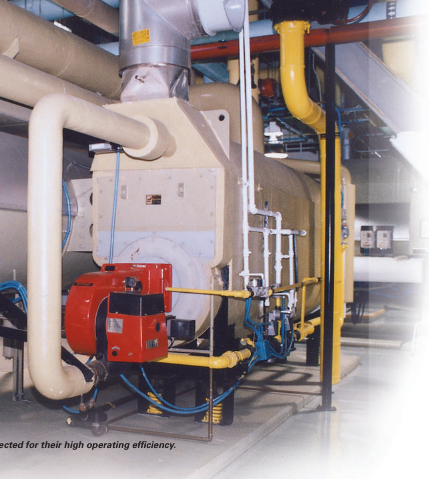
ected for their high operating efficiency.

of central-station electric generation and transmission, and the merits of alternative approaches. As mentioned earlier, the building structure itself, the use of daylighting, and the photovoltaic collectors are all part of this solution.